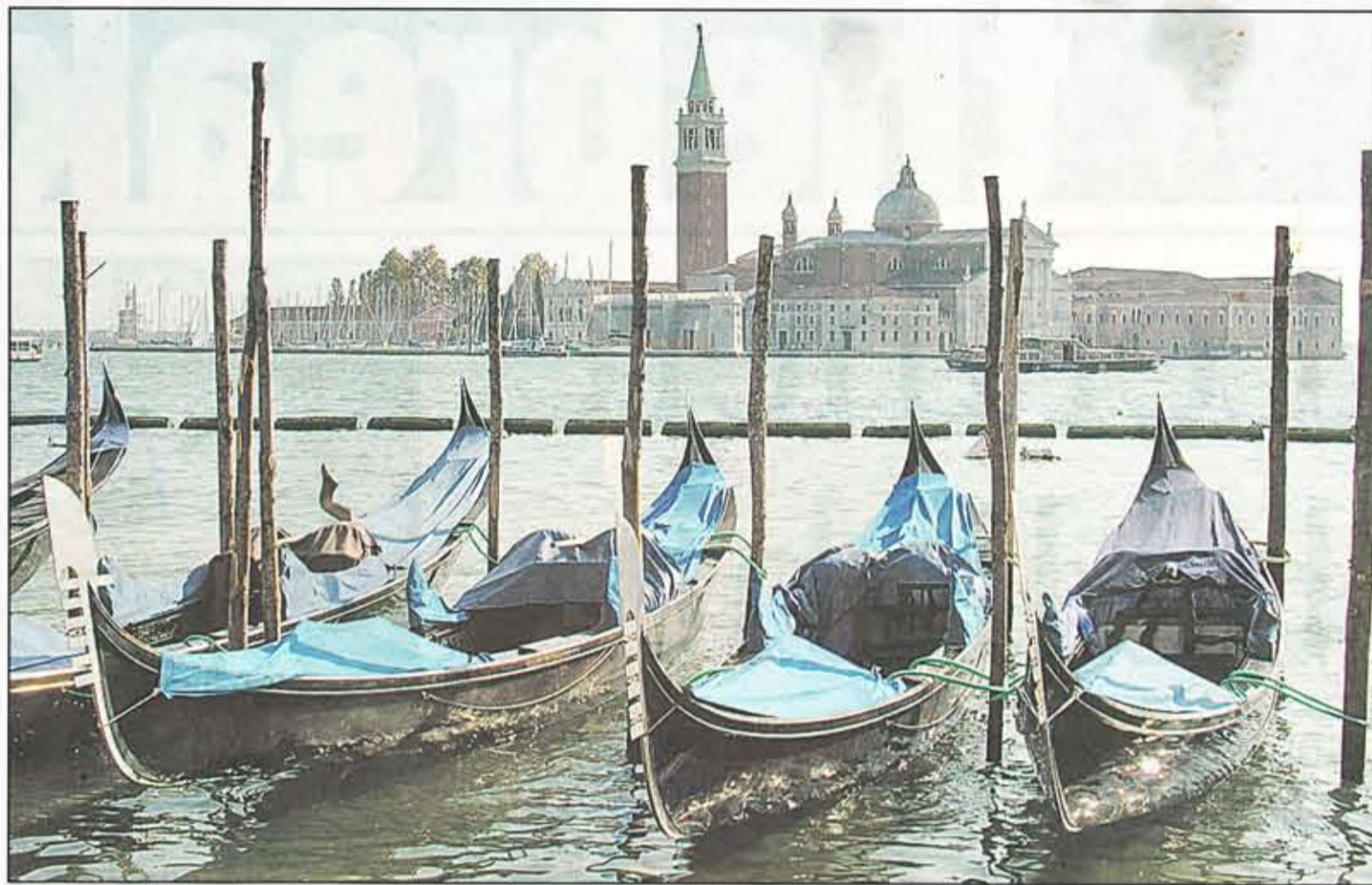
VENICE INSPIRATION: On her recent trip to Italy, Bronwyn spent two weeks in Venice – she loves the soft light there.